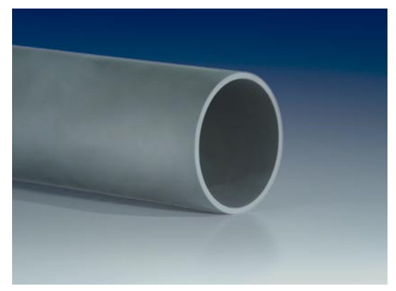
Sintered Silicon Carbide