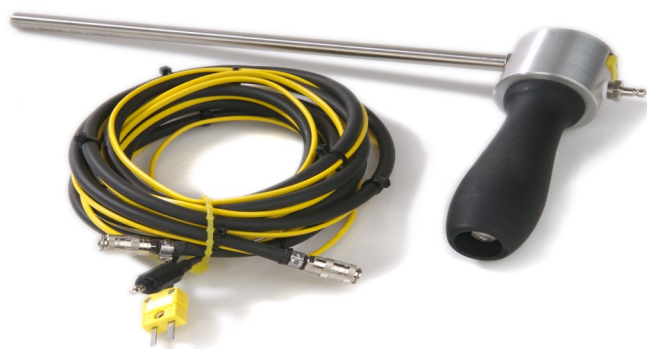
9" L x 3/8" O.D. Inconel probe with 10' viton hose

Built in Printer: 2" Graphic Thermal Printer